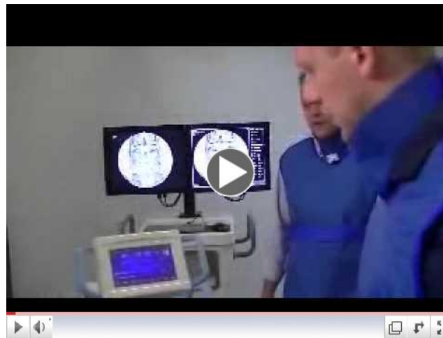
Live Demo C-arm Zen 7000